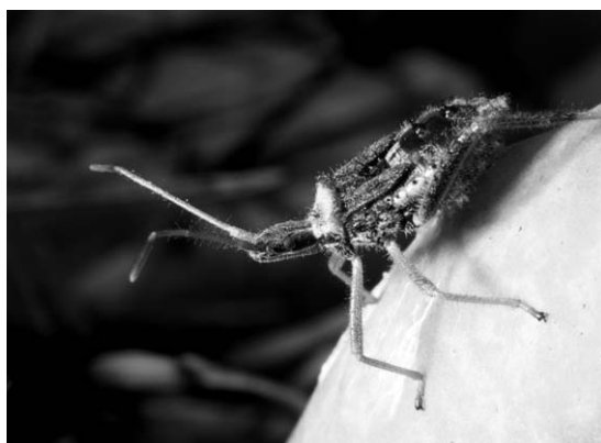
Fig. 1. Narnia femorata at the fifth instar.

At 10 weeks post-hatching, juveniles reared with fruits were significantly further along in their development than those reared without fruits ( \chi^2 = 29.745 , df = 1 , P < 0.001 ) (Fig. 2). In fact, 35 of the 37 surviving insects from the cla-